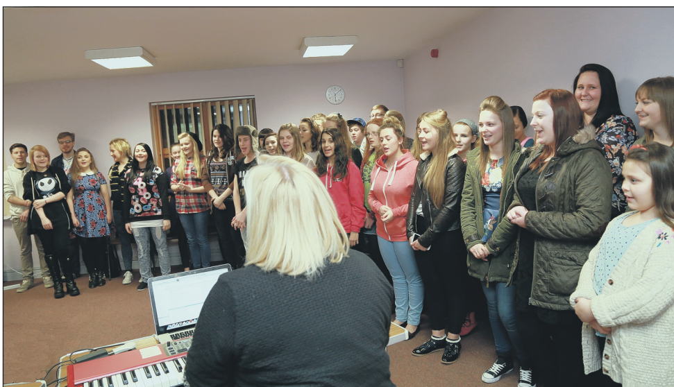
SINGERS Young singers from the Urban Vocal Group, pictured, are celebrating after the group for 11 to 18-year-olds in the Portsmouth and Havant areas received more than £53,000 of funding

UVG members have now performed more than 40 gigs across the south coast and are determined to keep up their